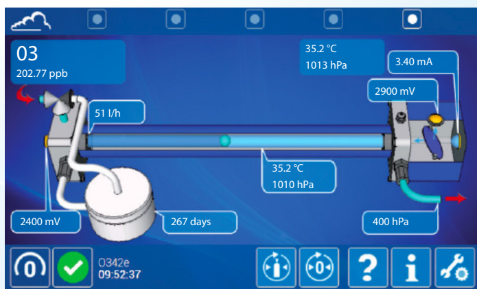
O342e Operating Principle

Increased reliability and metrological performances, recyclability, extended life-time while reducing operational cost and maintenance have been the key values guiding our R&D department for the development of the new, eco-designed e-Series of analyzers.